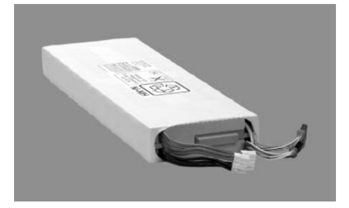
Fig. 2 Nickel metal hydride battery pack

high energy density, but it will be some time before they are ready for practical application in large capacity products. Electric double layer capacitors are effective for short-term backup, but they have low energy density, and they must be a larger volume than lead storage batteries. Nickel metal hydride batteries are used in the hybrid cars of major automakers, and with their large current discharge and their strong charge and discharge, they are also suitable for UPS. Furthermore, they have twice the energy density per unit volume of lead storage batteries, and about ten times the charge-discharge cycle lifetime making them suitable for longer life. For these reasons, nickel metal hydride batteries were chosen as the energy storage source to replace lead storage batteries in the "SANUPS A11G-Ni".